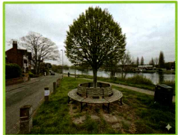
Artist Impression: The new Hornbeam and Bench at the half mile in 2046