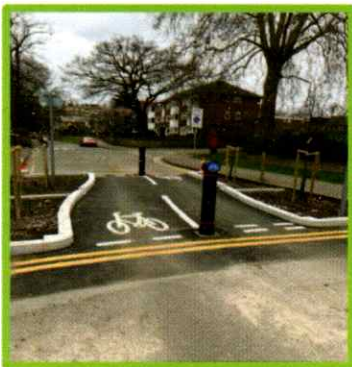
Rain Gardens: How our streets are getting ready for the rain

Have you spotted the new Rain Gardens on Lower Ham Road? These clever bits of landscaping divert heavy rain into the ground rather than overflowing our street drain: