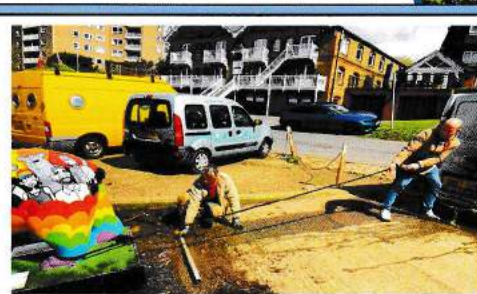
Heave Ho - but the plinth is full of bricks!