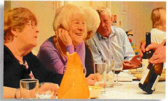
Happy trainee connoisseurs

At £15 a head, it was hard to resist this fun and educational experience, on 20 th April. Our palates were expanded as we discovered new and favourite combinations. It was hard to resist the Vouvray with the Stinking Bishop!!