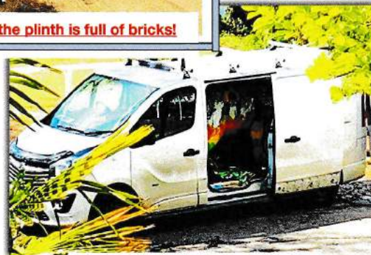
Hooray Bear's in the van at last