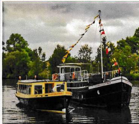
The Thames Boat Project

Working to protect and enhance our local environment