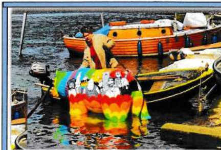
Boater Rik gets a rope round Bear's legs.