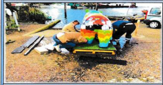
Remove bricks and unscrew Bear from plinth.