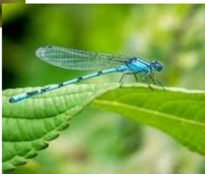
Rather delicate Damselfly right