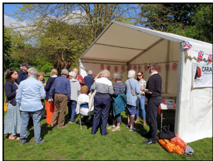
The CARA marquee generously loaned & erected by Project Marquee, from which we chatted and sipped bubbles with members. Bubbles courtesy of The Queen's Head