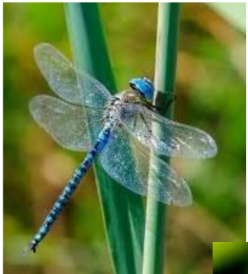
More robust Dragonfly above

The last newsletter showed us pipistrelle bats & baritone beetles but Elliot says to keep your eyes open for the flash of iridescent blue, darting up and down the river. It could be a dragonfly or a damselfly, both with two sets of wings that enable them to fly with great agility, backwards, up side down, as well as turn on a 'sixpence'. The damselfly is a little more delicate than the dragonfly but they are both expert at catching a delicious flying snack!