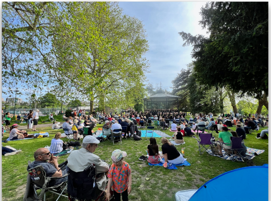
The Rock Choir on Sunday 4th June, had folk dancing or waving to the beat

Surrounded by Union flags we entertained members, friends, local councillors, our MP Sarah Olney (far left) and even the Town Cryer!