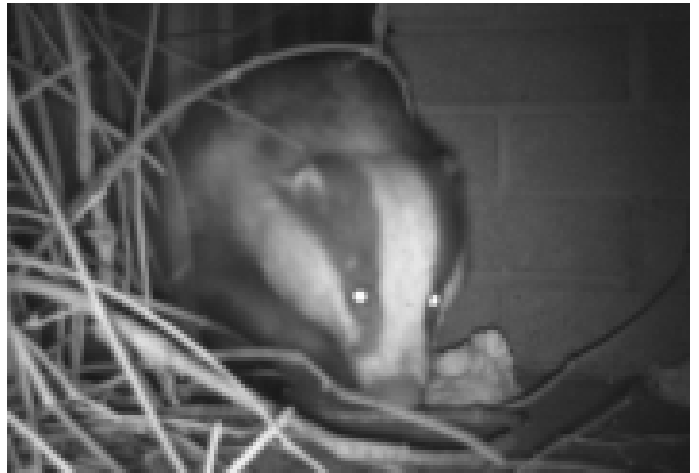
Night life in Lower Ham Road

CARA was surprised to find that our much loved local landmark, the Half-Mile Tree , was not legally protected so we suggested that it should have a Tree Preservation Order (TPO). But Kingston Council's tree officer tells us that, despite its local significance and great contribution to the amenity of the area, the tree will not be considered for a TPO because it is owned and maintained by the Council, is surveyed every year and not under any foreseeable pressure for works or removal or in danger of damage, and so is clearly being well cared for by the Council and does not need a TPO. Central government guidance is apparently that councils should not unnecessarily protect their own trees. We will continue to keep an eye on this and other local trees.