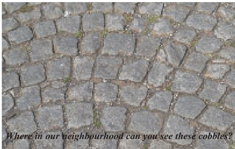
Where in our neighbourhood can you see these cobbles?

Several new species of duck formed breeding pairs this year along our stretch of the Thames, including Common Potchards, Tufted Ducks and Mandarin Ducks (pictured above, with the female, as usual among ducks, much drabber than the showy male), as well as the usual Egyptian Geese and Mallards, one of which was spotted with a family of 11 ducklings.