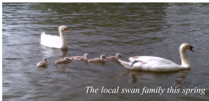
The local swan family this spring

■ Oak Processionary Moth nests were reported along the towpath just this side of the boundary stone. The caterpillars have nasty effects on human beings as well as on oak trees, and should have been removed by now.