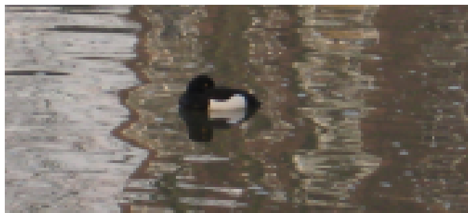
A Tufted Duck snoozes on the river one winter morning

■ Feed the birds: The RSPB has some good advice on its website, including a recipe for bird-cake and recommendations of nuts and seeds, grated cheese, pet food, breakfast cereals, leftover pastry and small amounts of breadcrumbs – but not salty foods, dry pulses, cooking fat, margarine, or porridge oats. Bird food is best kept off the ground where it can become soggy or attract squirrels, mice and rats. When everything is frozen do think about putting out some water too. Our local Parakeets, Pigeons, and, increasingly, Jackdaws, tend to dominate feeders, but smaller garden birds do still get the occasional look-in.