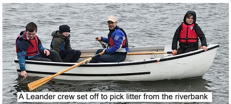
A Leander crew set off to pick litter from the riverbank

For the April litter-pick Leander Sea Scouts put out 3 boats and sent their supporters along the towpath to help other volunteers. Their work was much appreciated on a chilly, windy morning.